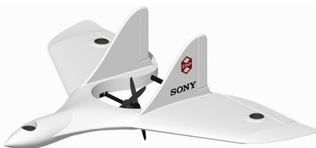
(Wing span 2,169mm× length 1,579mm× height 594mm)