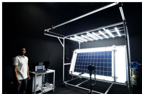
During a test