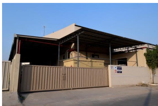
Testing lab exterior

The Mitsui Chemicals Group has previously built up a wide range of expertise relating to solar power generation. And based on this expertise, the group has fostered enough trust to be able to register a Bureau of Indian Standards (BIS)* 2 testing and certification lab before any other Japanese company. This lab will now be used for testing the performance and reliability of solar panels, allowing the Mitsui Chemicals Group to launch its business for BIS certification.