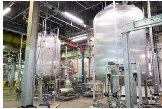
Pigment dispersions manufacturing equipment

Last year, Fujifilm announced the construction of its first dispersion manufacturing facility in the U.S., which is on schedule to be commissioned by spring 2022. This will expand the Company's existing Europe-based production to the U.S. Today's announcement brings Fujifilm's total investment to over $47 million in new production capacity of pigment dispersions at the Delaware site. To support the increase in manufacturing output across the site, FUJIFILM Imaging Colorants, Inc. is adding 30 positions in quality, engineering, production, and administrative roles by the end of 2023 to support operations across both facilities.