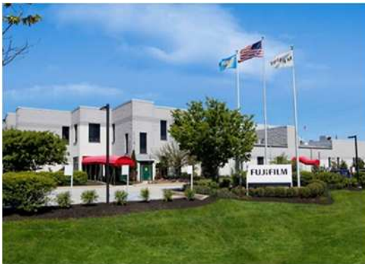
Reception building of FFIC Inc.

Construction of the new facility, which adds 11,000 sq. ft. of plant to the Delaware site, began in March 2022 and is expected to be operational by summer 2023.