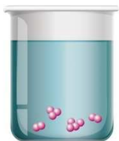
<Aggregated and settled pigment particles>

Last year, Fujifilm announced the construction of its first dispersion manufacturing facility in the U.S., which is on schedule to be commissioned by spring 2022. This will expand the Company's existing Europe-based production to the U.S. Today's announcement brings Fujifilm's total investment to over $47 million in new production capacity of pigment dispersions at the Delaware site. To support the increase in manufacturing output across the site, FUJIFILM Imaging Colorants, Inc. is adding 30 positions in quality, engineering, production, and administrative roles by the end of 2023 to support operations across both facilities.