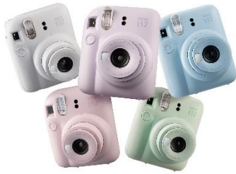
18. Instant camera "INSTAX mini 12™"