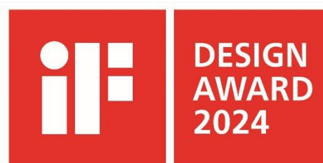
“iF Design Award 2024” logo