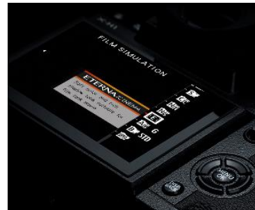
23. Film Simulation Experience