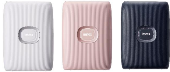
19. Smartphone printer "INSTAX mini Link 2™"