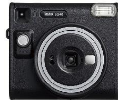
21. Instant camera "INSTAX SQUARE SQ40™"