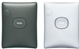
20. Smartphone printer "INSTAX SQUARE Link™"