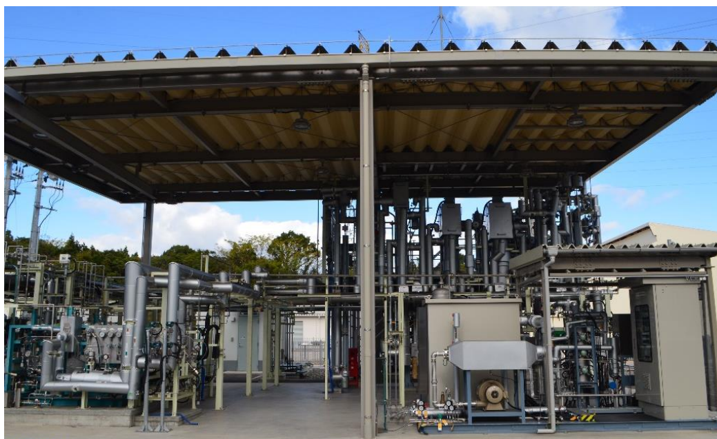
Figure 1 Exterior view of the bench-scale testing facility at NEDO's R&D and Demonstration Base for Carbon Recycling

Efforts to combat global warming are progressing, with the aim of achieving a carbon-neutral society by 2050. Against that backdrop, this project seeks to develop technology for the effective use of CO 2 emitted by factories and the like. The project partners recently carried out a test in which they produced para-xylene using methanol synthesized from CO 2 and hydrogen, conducting this at NEDO's R&D and Demonstration Base for Carbon Recycling at Osaki-Kamijima, Hiroshima (Figure 1).